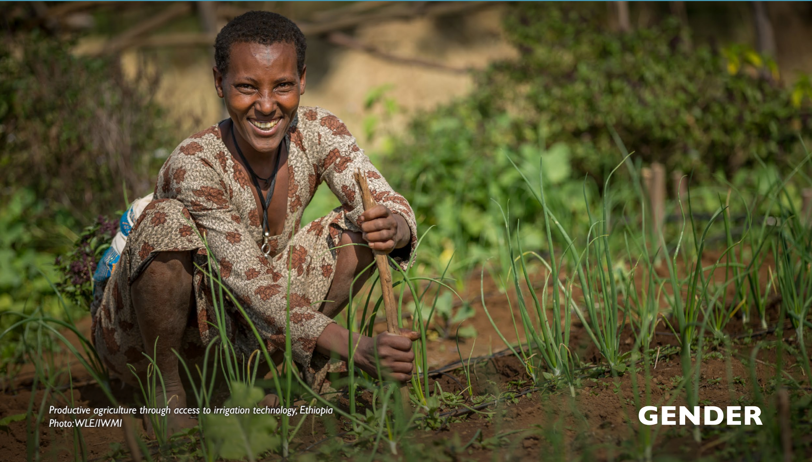
Productive agriculture through access to irrigation technology, Ethiopia

The U.S. Government's Global Hunger & Food Security Initiative