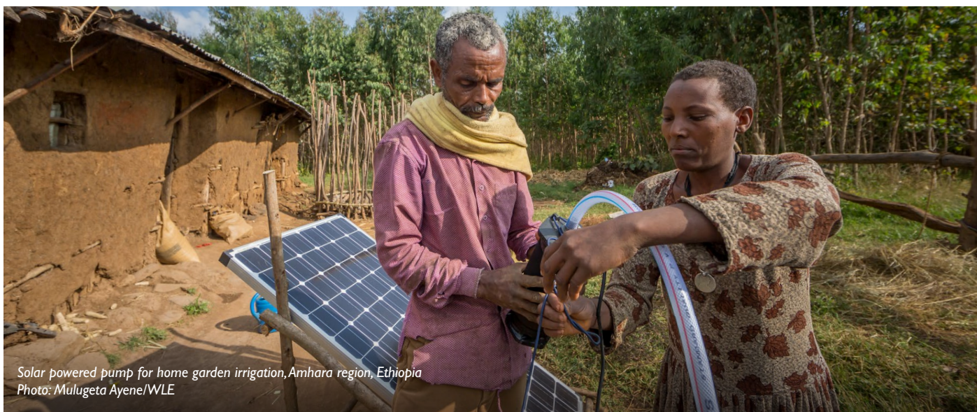
Solar powered pump for home garden irrigation, Amhara region, Ethiopia