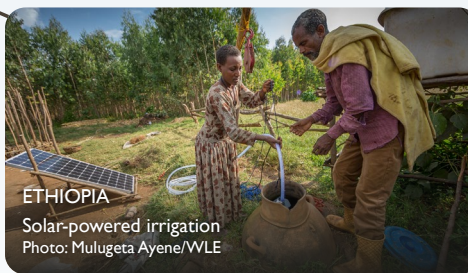
ETHIOPIA Solar-powered irrigation