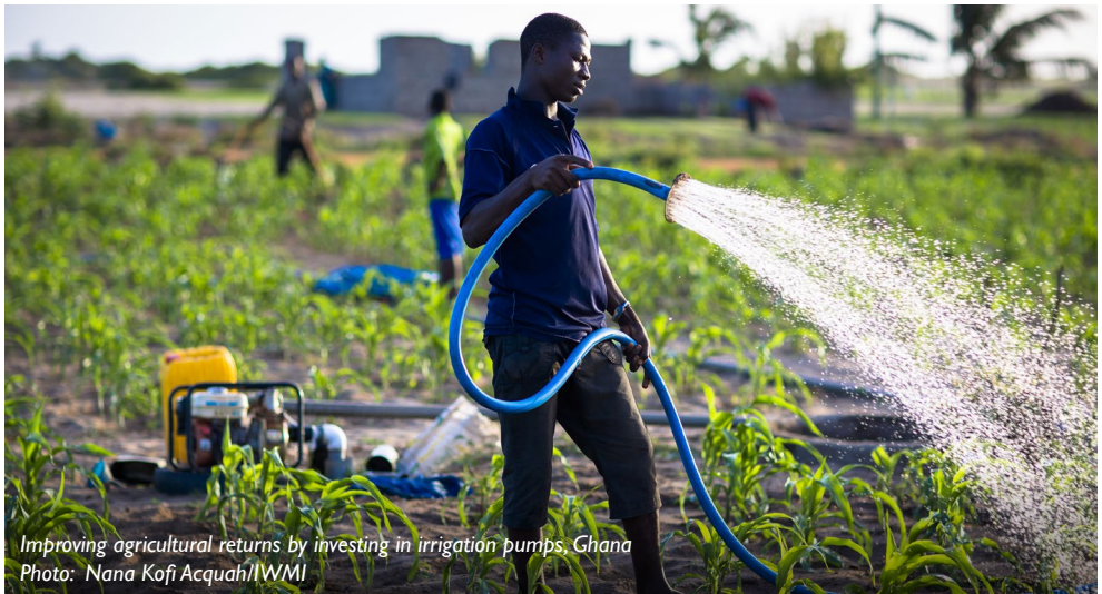
Improving agricultural returns by investing in irrigation pumps, Ghana

Profitable small scale irrigation has the potential to make a significant contribution to the achievement of a range of Sustainable Development Goals. To help secure this contribution ILSSI is committed to exploring how best to expand access to, and the use and sustainable management of, diverse, farmer-led, context specific, irrigation technologies and approaches.