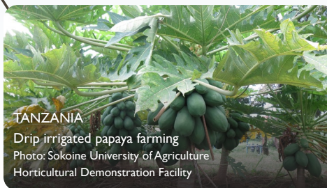
TANZANIA Drip irrigated papaya farming