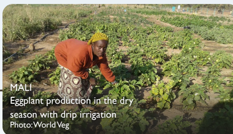
MALI Eggplant production in the dry season with drip irrigation