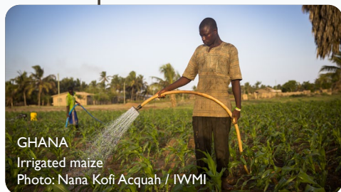
GHANA Irrigated maize