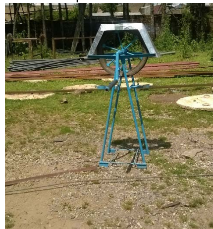
Figure 1: Overview of the four water lifting technologies used in the experimental design

For the irrigated vegetable experiments farmers will have a land size allocated to the project between 100 and 250 m 2 while the irrigated fodder farmers have fields between 50 and 1000 m 2 . The land size for the fruit tree experiment is currently unknown. All farmers will receive the technologies on credit and will be asked to pay back their technologies over a 3 year time span with the first payment to be done after the rainy season in 2015.