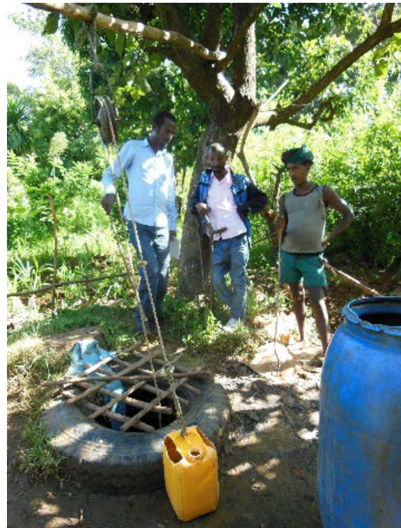
Rope and washer