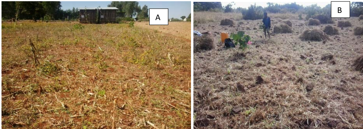
Figure 2: Experimental plots selected at different landscapes for Hardpan (Downslope and Upslope, respectively.)